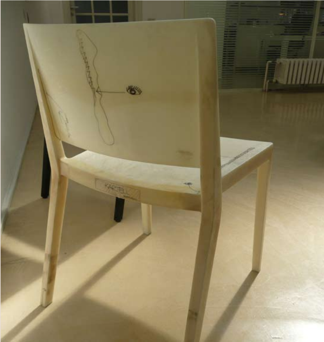
LIZZ, prototype, 2007, manufactured by Kartell by Piero Lissoni (Italy)

Chair in batch-dyed thermoplastic technopolymer, manufactured in one single piece using the gas-blowing technology. It has a squared contour, a wide seat and a low roomy backrest. It is extremely stable, shockproof and scratch resistant. It comes in a wide range of colours in a glossy version. The name of the project was inspired by Liz Taylor, using the 'modified' name Lizz, as the traditional proportions of a chair were modified.